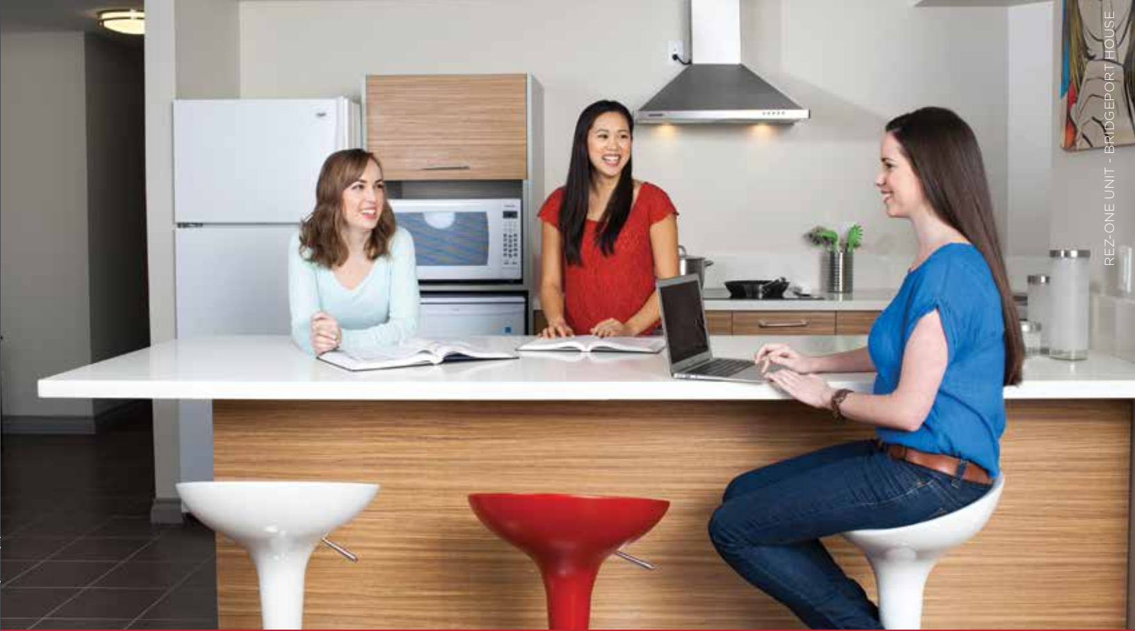
REZONE UNIT - BRIDGEPORT HOUSE

Rez-One offers both single and group occupancy with group suites housing 3, 4 and 5 students per unit. Suite access is controlled through a key fob security system while each bedroom is controlled by individual electronic keypads.