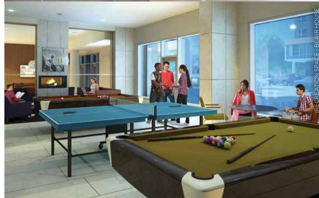
RECREATION SPACE - BLAIR HOUSE

THE #1 CHOICE FOR OFF-CAMPUS CONDO-STYLE LIVING FOR THE CONSCIENTIOUS STUDENT