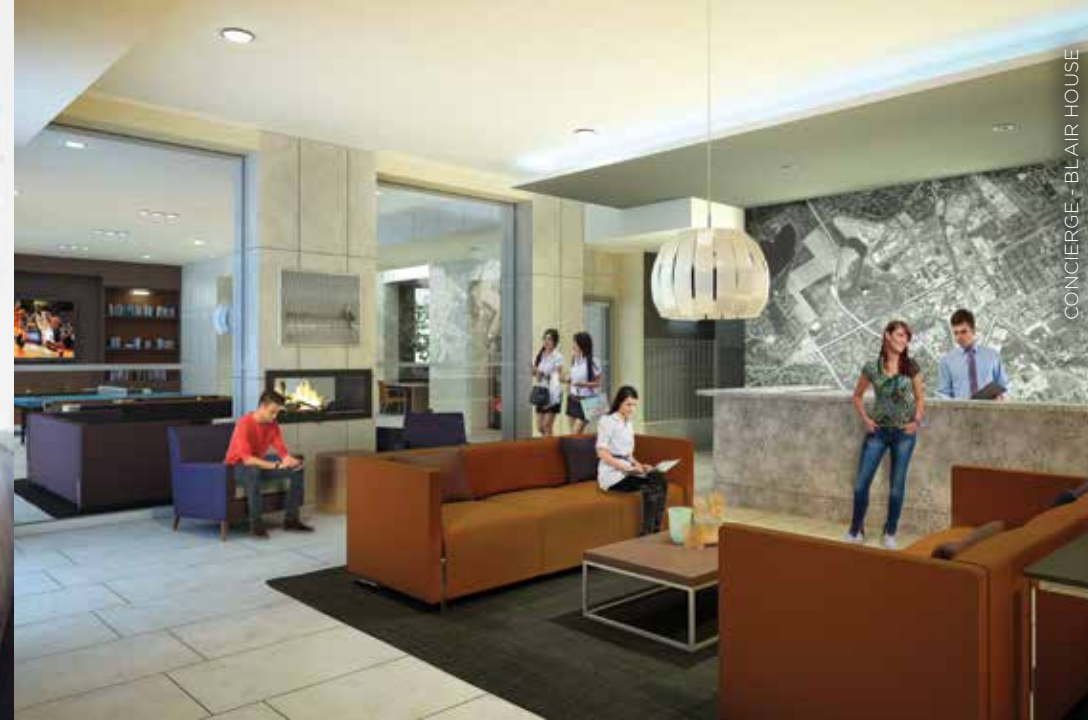
CONCIERGE - BLAIR HOUSE