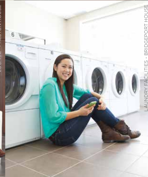
LAUNDRY FACILITIES - BRIDGEPORT HOUSE