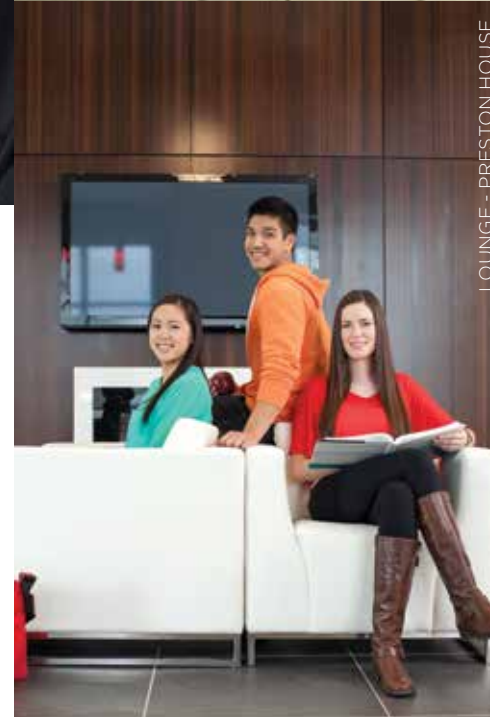
LOUNGE - PRESTON HOUSE